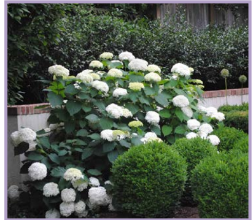
New Wood Bloomer: Annabelle

These are the hydrangeas that set flower buds on current season wood (new wood). It is easy to grow these hydrangeas because they bloom every year regardless of how they are cared for or treated. They can be pruned to the ground in the fall and they will emerge in the spring with bountiful blooms. However over a period of time this drastic pruning may cause the plant to slowly weaken. Included in this group are the PeeGee types ( H. paniculata ) and the Annabelle types ( H. arborescence ). Both of these are gaining in popularity and more available in nurseries.