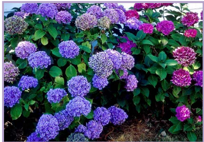
Old Wood Bloomer: Mophead

The type most commonly found in the garden is the one that produces buds on “old wood”. This includes the old garden hydrangeas such as Mophead, Big Leaf, and Lacecap types ( Hydrangea macrophylla ) and the Oakleaf hydrangea ( H. quercifolia ). They all produce blooms on old wood.