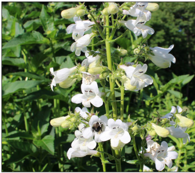
A bumble bee delves into foxglove beardtongue.

Soil testing can provide you with useful information regarding pH and organic matter content, but wildflowers generally prefer low fertility sites. Determine whether the soil tends to be wet or dry, and if the site gets full sun, filtered sun or shade.