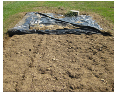
A clean seed bed is exposed when black plastic is removed in September, after being in place for several weeks.