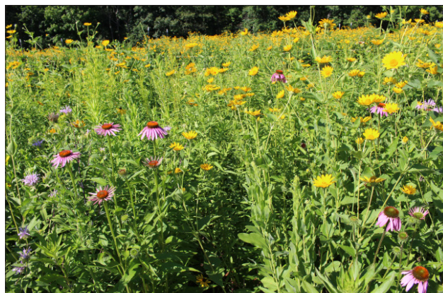
Third year after planting (early August).