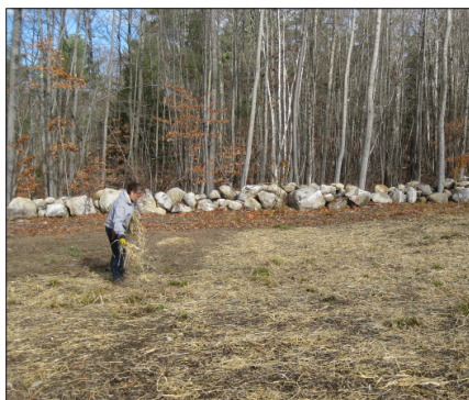
After rolling, cover with a light mulch of clean straw.

When broadcasting seed, divide the total amount of seed in half. Mix the first half with the carrier and spread it as evenly as possible, going back and forth in one direction (following the black lines), then mix and spread the other half in the other direction (blue lines). For large areas, divide the total area into several areas of 400-500 square feet each and spread the seed in each area in this manner to get the most uniform distribution of seed possible.