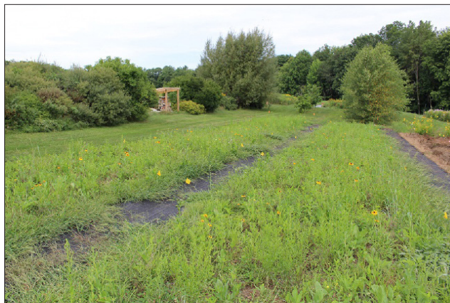
First year after planting (mid-August).