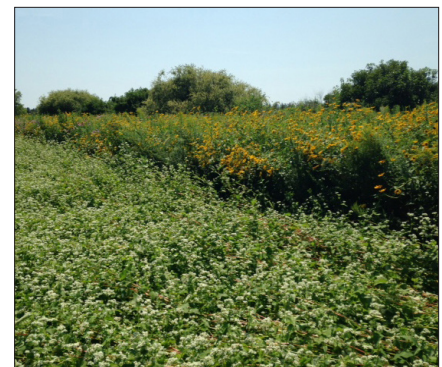
A buckwheat cover crop in front of a previously established meadow.