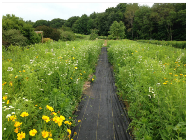
Second year after planting (mid-June).