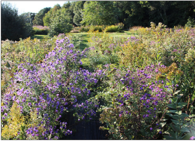
Third year after planting (late September).