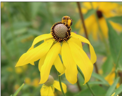
A pollen-loaded native bee on yellow coneflower.