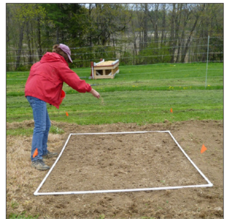
Broadcasting seed by hand over a small area.

Mix the seed with vermiculite or other carrier for one subplot at a time in a plastic paint bucket or similar container. Start with the dry carrier then add small amounts of water at a time, stirring until it is