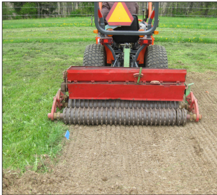
Rolling with a cultipacker (shown here) or lawn roller ensures good seed to soil contact.

For each subplot, apply half the amount of seed while walking back and forth in one direction, then repeat in the other direction, as shown in the diagram below. Using a light-colored carrier such as vermiculite allows you to see how evenly you have distributed the mix on the soil surface. Scatter any remaining seed where needed.