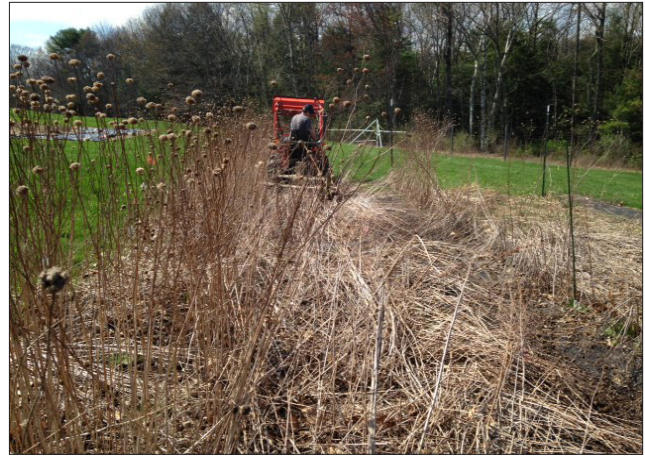
A meadow does not need a dormant season mowing every year, just often enough to keep shrubs and trees from growing up.