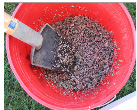
Mixing the wildflower seed with moist vermiculite keeps the seed uniformly well-mixed and easy to spread evenly.