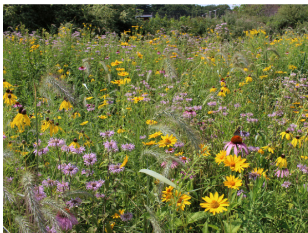
Second year after planting (early August).