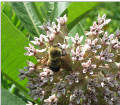
Common milkweed flowers support many bees and butterflies.