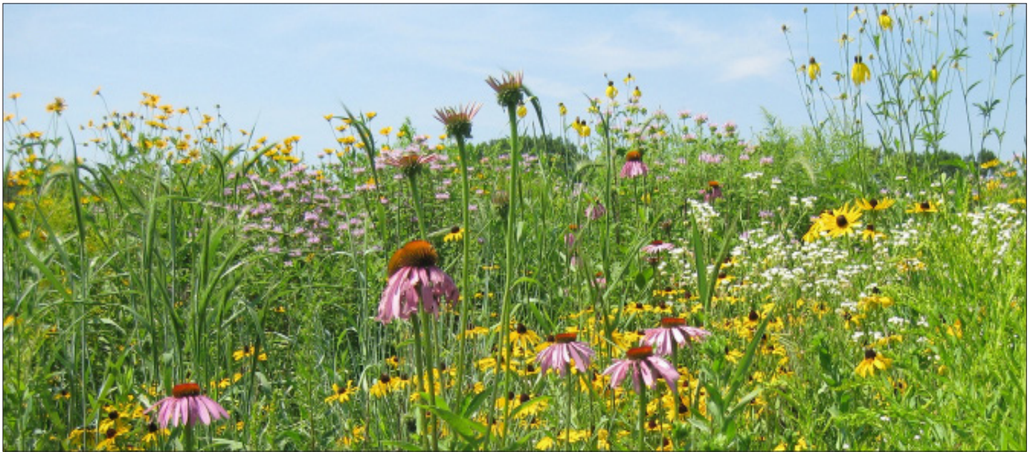
An established meadow should be dense enough to out-compete weeds and should provide a succession of diverse flowers to support pollinators.