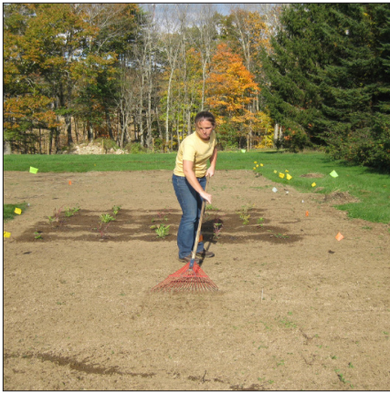
Raking lightly after broadcasting helps work the seeds into the soil.

slightly damp but not wet. Now you can mix in your seeds; the small seeds will stick to the carrier particles, keeping everything well-mixed for distribution. Add the wildflower seeds first, then the grass seeds, adding more water or vermiculite if needed. The precise amount isn't important, but using 0.5 to 1 gallon of the carrier per 500 square feet area is adequate. Wearing latex gloves will keep the seed from sticking to your hands.