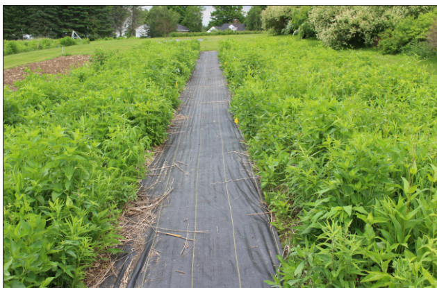
Third year after planting (early June).