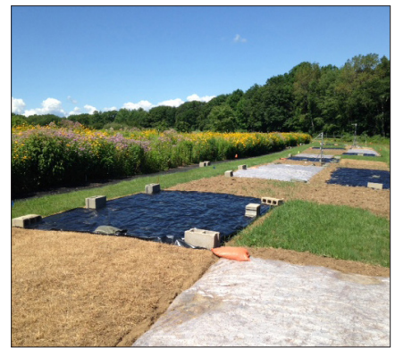
Overview of research trial comparing various methods of site preparation for killing existing vegetation before seeding a meadow mix.