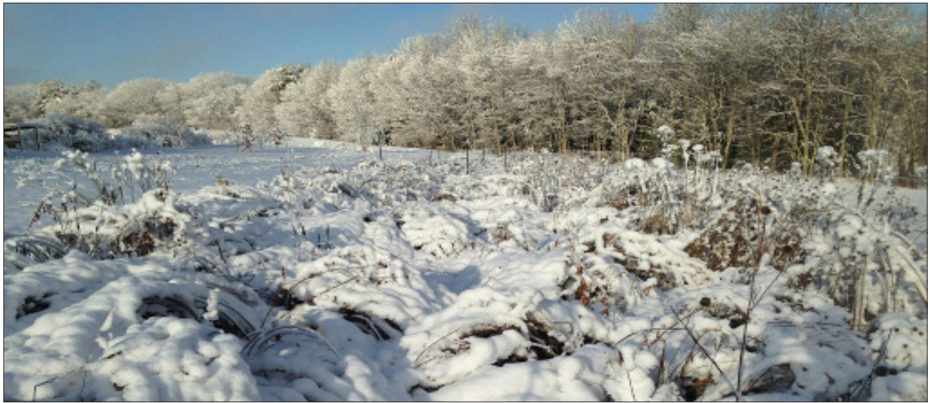
The meadow in winter.