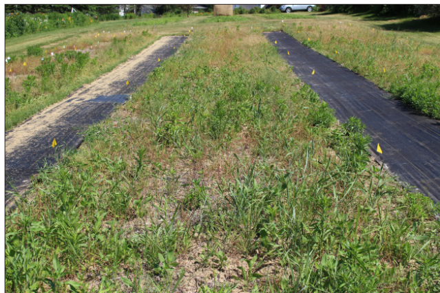
First year after planting (mid-June).

These photos show the growth and development of the same meadow planting over time.