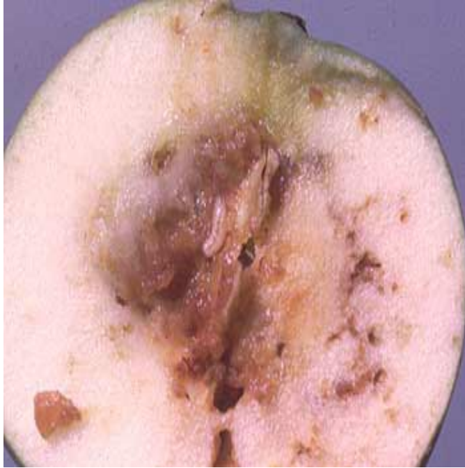
Figure 4. Apple maggot (see larvae in middle) makes tracks in fruit that turn brown and rot.