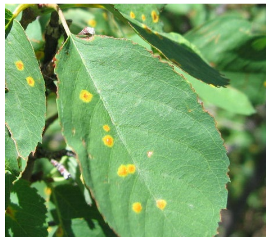
Figure 2. Cedar apple rust lesions on apple leaves