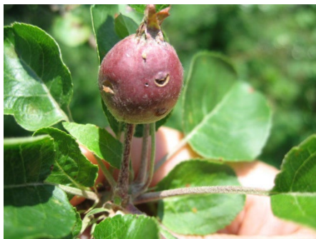
Figure 6. Egg laying scars caused by the plum curculio.