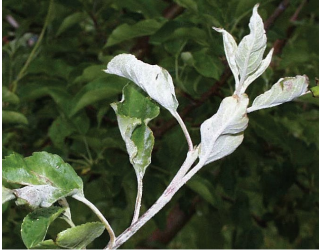
Figure 3. Powdery mildew can stunt shoot growth and russet fruit.