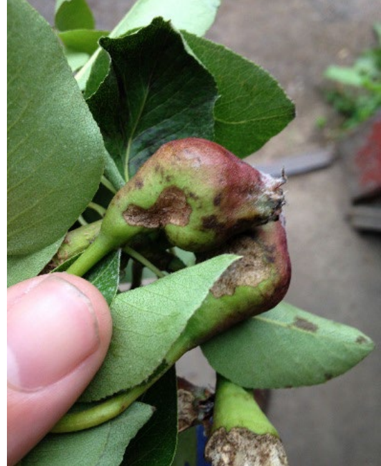
Figure 5. Surface feeding by a leafroller caterpillar