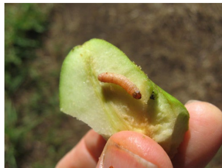
Figure 7. Codling moth larvae has dark head and pinkish body.

Plum curculio over-winter as adults in the soil, litter, ground cover trash in orchards and surrounding areas. When evening temperatures exceed 60 F, the weevils move into orchards and begin to feed as leaves begin to emerge. Their feeding activity expands to blossoms, stems and fruit as they become available. In a backyard orchard, insecticide treatment generally starts when fruit reach about ½ inch in diameter. The tarnished plant bug has a piercing mouthpart and causes uniform indentations tapering