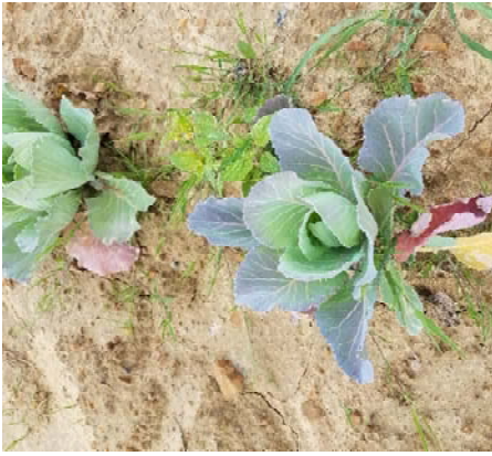
Overall image of the symptoms on the plant