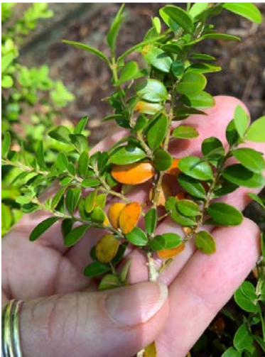
Well-focused close-up image