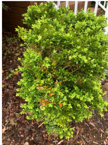
Overall image of the whole plant