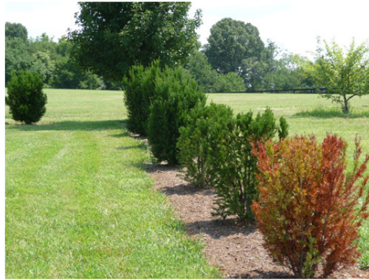
Pattern of the problem in the landscape