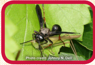
Grass carrying wasp Isodontia spp. 16–23 mm