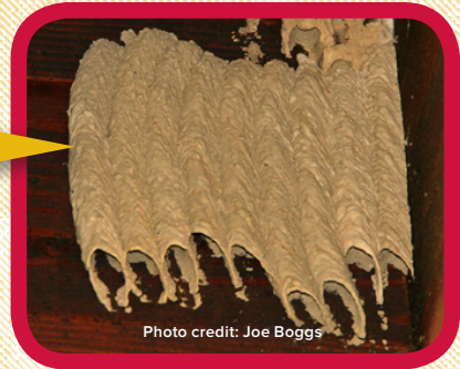
Mud dauber tubes