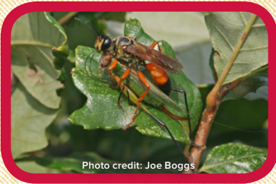
Great golden digger Sphex ichneumoneus 19–27 mm