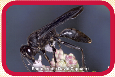
Great black wasp Sphex pensylvanicus 22–38 mm