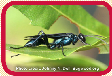
Blue mud dauber Chalybion californicum 13–22 mm