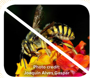
Wool carder bee: Not a wasp