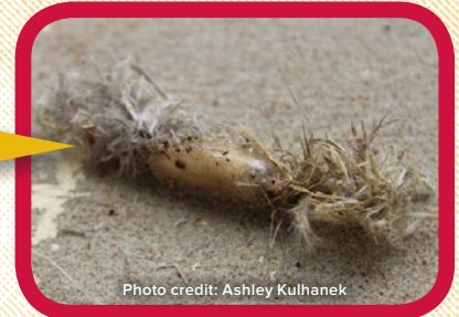
Grass carrying pupa (Pupa is often found in window sashes or in bee hotel tubes.)