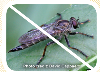
Fly: Not a wasp