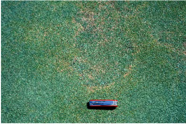
Figure 3. Active summer patch on a mixed creeping bentgrass/ Poa annua putting green. Note that only the P. annua is affected.