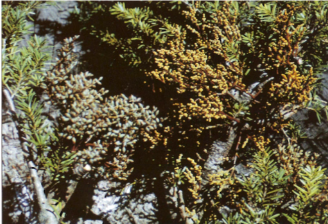
Fig. 2. Aerial shoots of hemlock dwarf mistletoe: female plants with berries on the left, male plants on the right.

Hemlock dwarf mistletoe is a small, leafless flowering plant consisting of an endophytic system and aerial shoots. The dwarf mistletoes are obligate parasites,