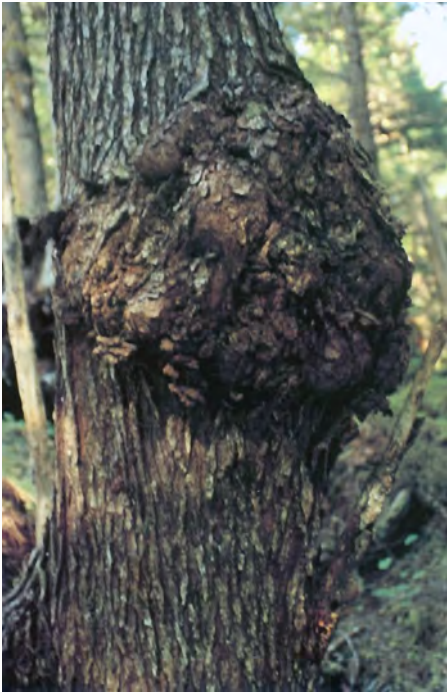
Fig. 4. Old bole infections resembling large burls develop from hemlock dwarf mistletoe infections that grow into the bole from the tree's leader or branches.

often be seen easily from the ground (Figure 3c). Brooms are even more obvious on dead trees. Witches' brooms vary from small, palm-like structures in young infections to large masses of branches weighing several hundred pounds. Brooms can grow to very large size and survive for 100 years or more. Infections can occur in the main stem of trees, some of which originate in side branches and grow into