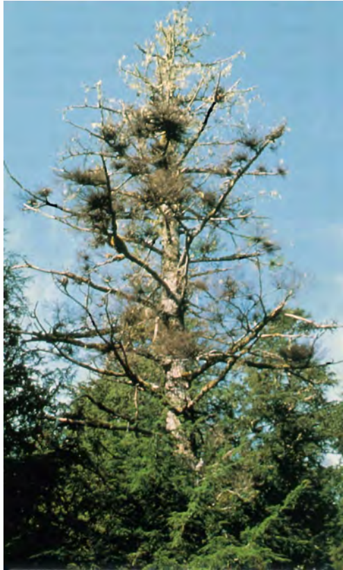
Fig. 5. Western hemlock tree mortality from severe infection with hemlock dwarf mistletoe.

Witches' brooms and swellings divert the tree's resources to these points of infection. This can adversely affect tree height and diameter growth, reduce tree vigor, and make infected trees more susceptible to insects and other diseases. The degree of growth loss is directly correlated to the intensity of infection (the number and size