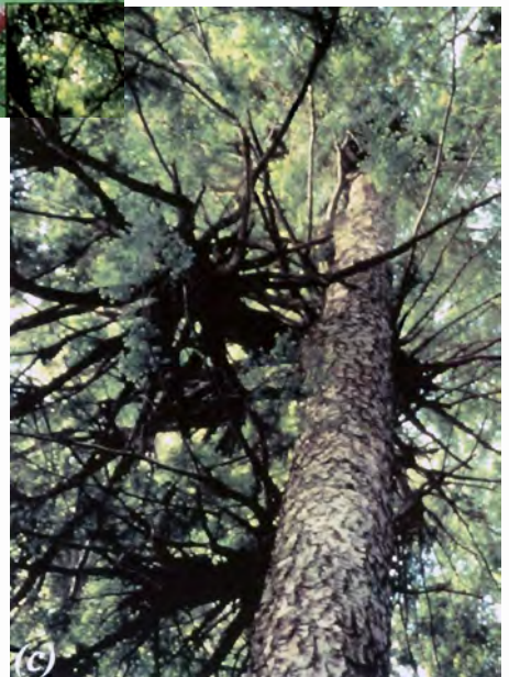
Fig. 3. Swelling and witches' brooms of hemlock dwarf mistletoe: (a) indicate young infections which grow into young brooms (b) and finally large brooms (c).

and frequently become spindle-shaped (elongated with the axis of the branch). With time, infected tissues begin to develop a proliferation of branches known as witches' brooms (Figure 3b). These brooms are the most conspicuous symptom of dwarf mistletoe infection and can